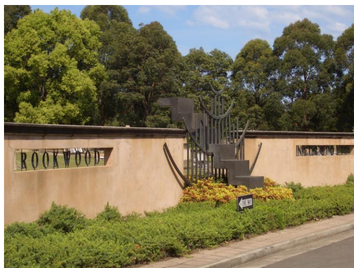
Rookwood Cemetery, Sydney