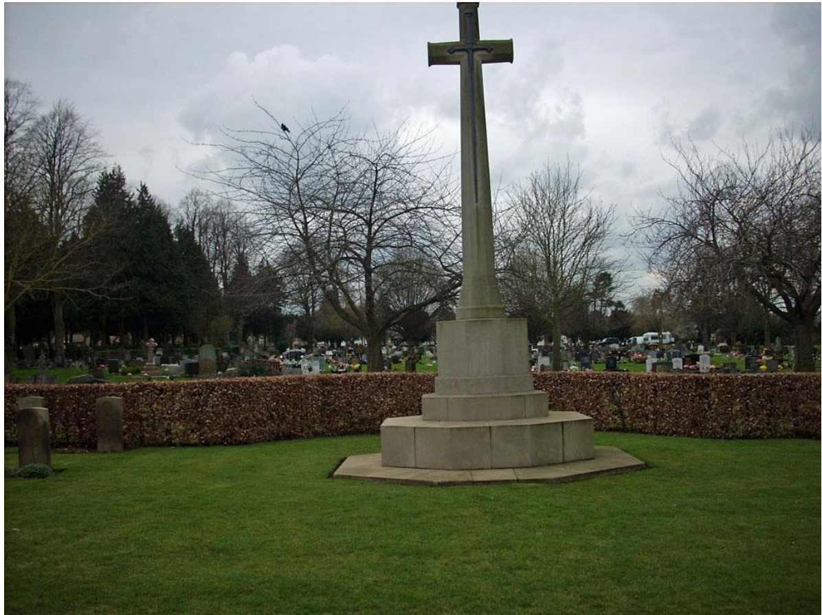
Cross Of Sacrifice at Towcester Road Cemetery, Northampton