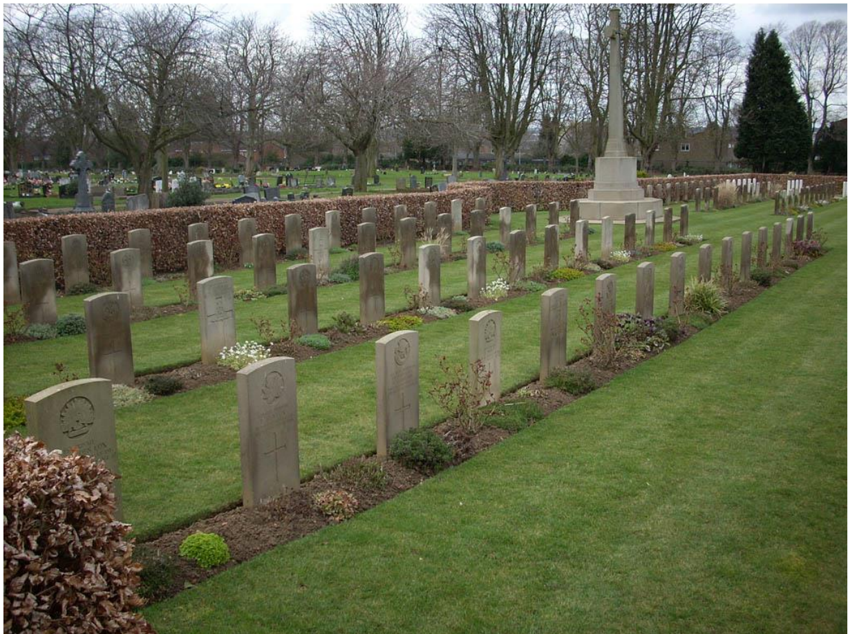
Towcester Road Cemetery, Northampton