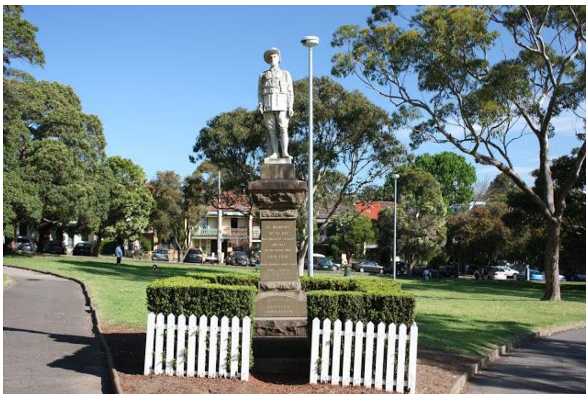
Camperdown War Memorial