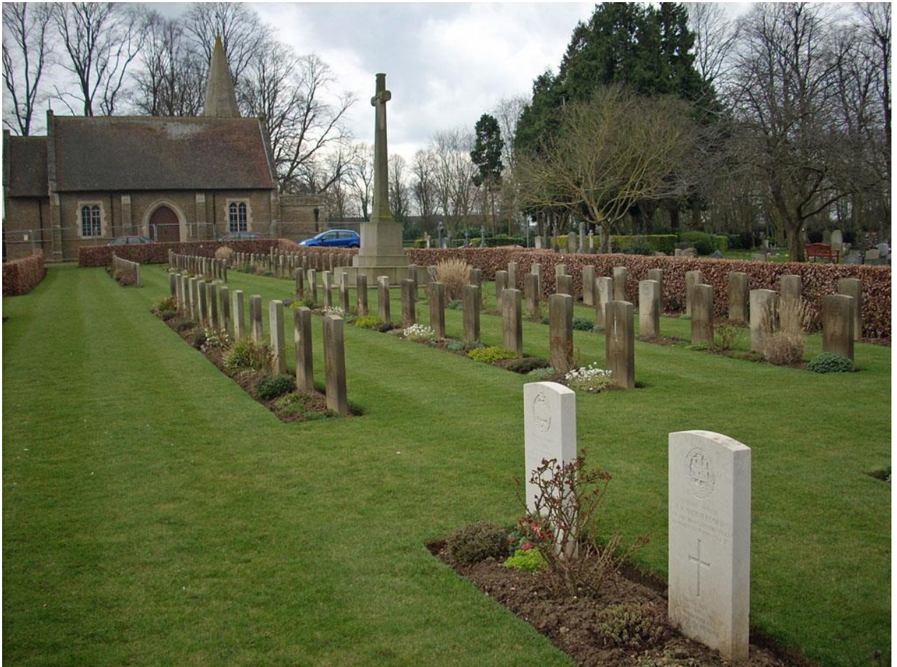
Towcester Road Cemetery, Northampton